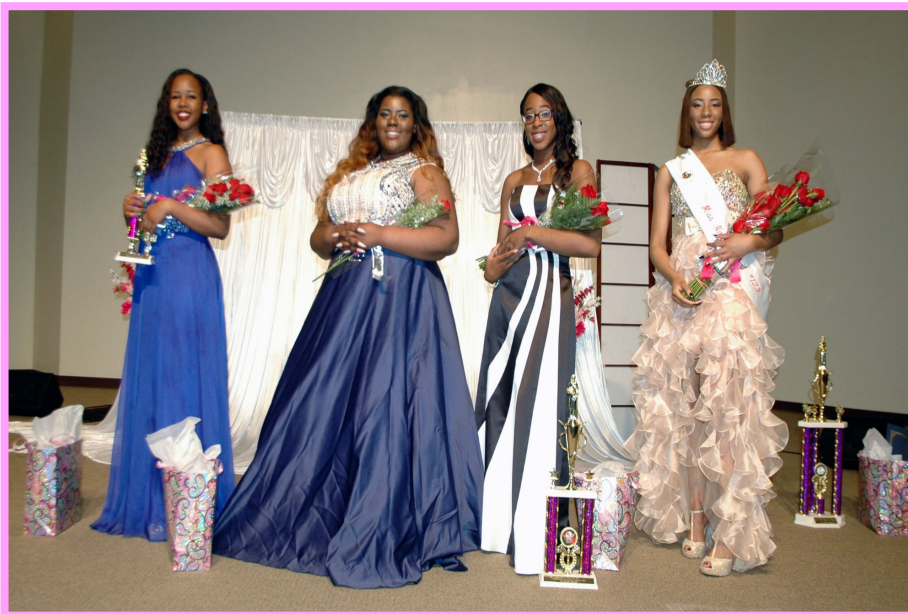
2017 Royal Court Nabbar Court No. 123 Talent & Scholarship Pageant

Nabbar Court No. 123 held it's Annual Talent and Scholarship Pageant on Sunday, April 19, 2017. The Talent and Scholarship Pageant provides scholarships to high school seniors who are interested in attending colleges or universities.