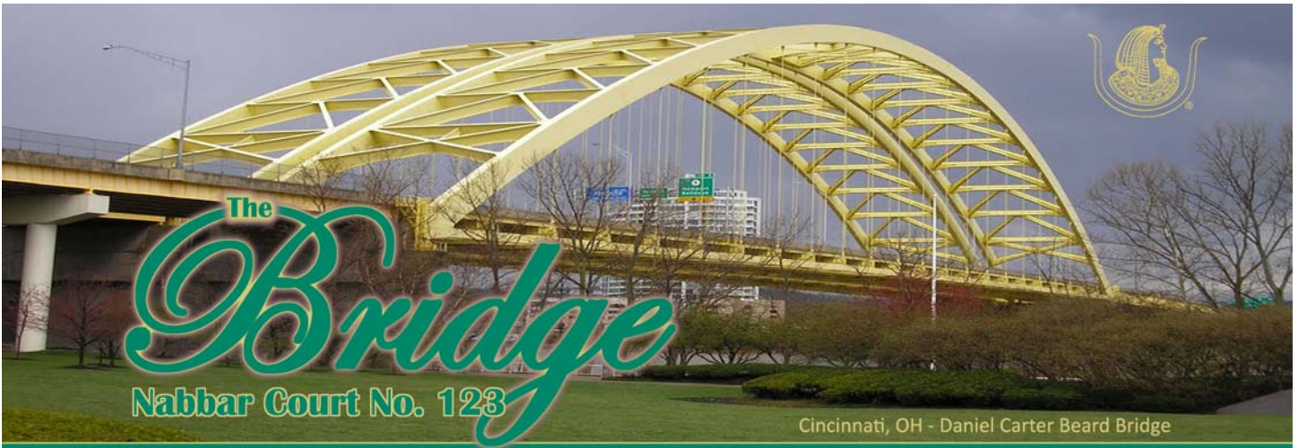
Cincinnati, OH - Daniel Carter Beard Bridge

DAUGHTERS OF ISIS • OASIS OF ATLANTA • DESERT OF GEORGIA • SEVENTEENTH EDITION – VOL 7:2, 2011