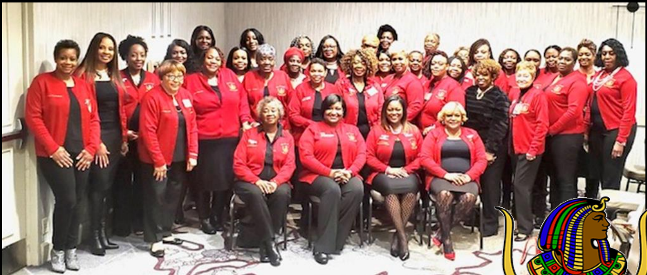
Nabbar Court No. 123

The Desert Retreat/Planning was held at the Marriott Hotel – Emory Area, 2000 Century Center Boulevard NE, Atlanta, Georgia 30345 hosted by Al-Karim - Oasis of Riverdale, Desert of Georgia.